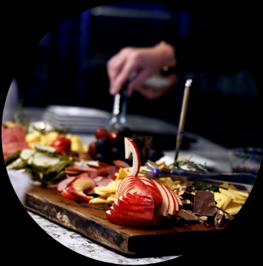
Cheese & Charcuterie